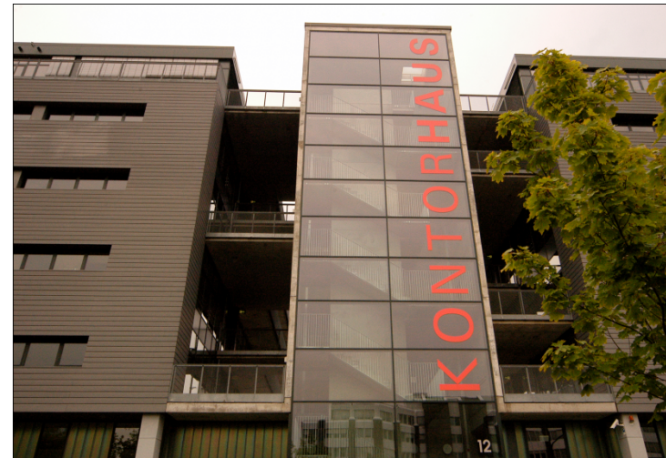
DE-CIX Competence Center @ Kontorhaus Building Frankfurt Osthafen (Docklands)

Phone +49 69 1730 902 - 0 info@de-cix.net